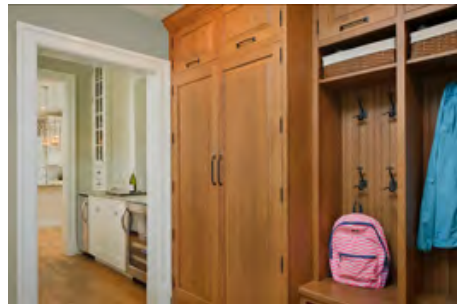
Right: This PBA mudroom design, located adjacent to the kitchen, provides storage and functionality, but doesn't lack in style. The historic home's character is retained by using traditional cabinetry and details.