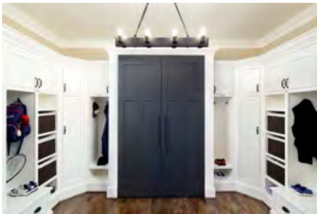
Left: For the homeowner's three active boys, this PBA mudroom design provides an abundance of storage in a classic navy and white color scheme.